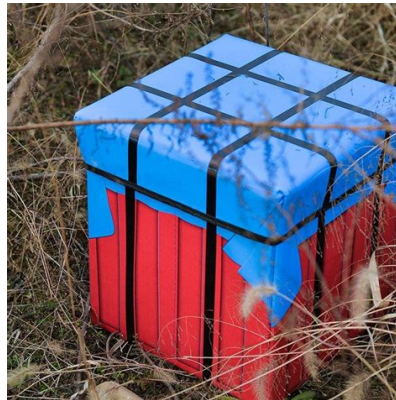
Airdrop in the game(?)

PUBG is a multiplayer online battle royale video game. In the game, up to one hundred players parachute onto an island and scavenge for weapons and equipment to kill others while avoiding getting killed themselves. Airdrop in this game is a key element, as airdrops often carry with them strong weapons or numerous supplies, helping players to survive.