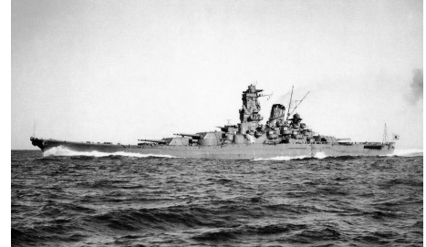
Yamato with her 9x46cm guns

Note m_i will not necessarily decrease as l_i goes up, because having more guns will also bring crew members pride and increase their morale. This in turn will bring up the battle efficiency of the whole ship.