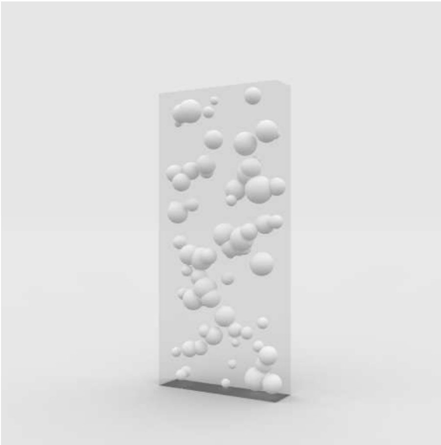
Figure 12: A strange object

In the year 2xxx, an expedition team landing on a planet found strange objects made by an ancient species living on that planet. They are transparent boxes containing opaque solid spheres (Figure 12). There are also many lithographs which seem to contain positions and radiuses of spheres.