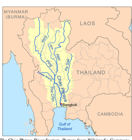
The Chao Phraya River System.

A simplified model of this river system is shown in Figure F.1, where the smaller red numbers indicate the lengths of various sections of each river. The point where two or more rivers meet as they flow downstream is called a confluence . Confluences are labeled with the larger black numbers. In this model, each river either ends at a confluence or flows into the sea, which is labeled with the special confluence number 0. When two or more rivers meet at a confluence (other than confluence 0), the resulting merged river takes the name of one of those rivers. For example, the Ping and the Wang meet at confluence 1 with the resulting merged river retaining the name Ping. With this naming, the Ping has length 658 km while the Wang is only 335 km. If instead the merged river had been named Wang, then the length of the Wang would be 688 km while the length of the Ping would be only 305 km.