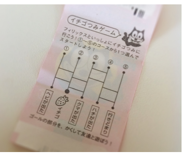
Strawberry picking game

Amida-kuji is a lottery popular in Japan, which can be used to assign w prizes to w people. The game consists of w vertical lines, called legs , and some horizontal bars that connect adjacent legs. The tops of the legs are the starting positions of the w people, and the prizes are at the bottom of the legs. To determine the prize of the i th person, one has to move down on the i th leg, starting at the top, and switch the leg whenever a horizontal bar is encountered. You can see such a game and how to trace a path in Figure J.1.