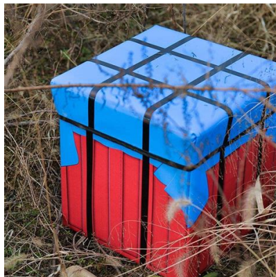
Airdrop in the game(?)

PUBG is a multiplayer online battle royale video game. In the game, up to one hundred players parachute onto an island and scavenge for weapons and equipment to kill others while avoiding getting killed themselves. Airdrop in this game is a key element, as airdrops often carry with them strong weapons or numerous supplies, helping players to survive.