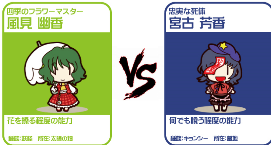
Plants vs. Zombies(?) (Image from pixiv. ID: 21790160; Artist: socha)

BaoBao and DreamGrid are playing the game Plants vs. Zombies . In the game, DreamGrid grows plants to defend his garden against BaoBao's zombies.